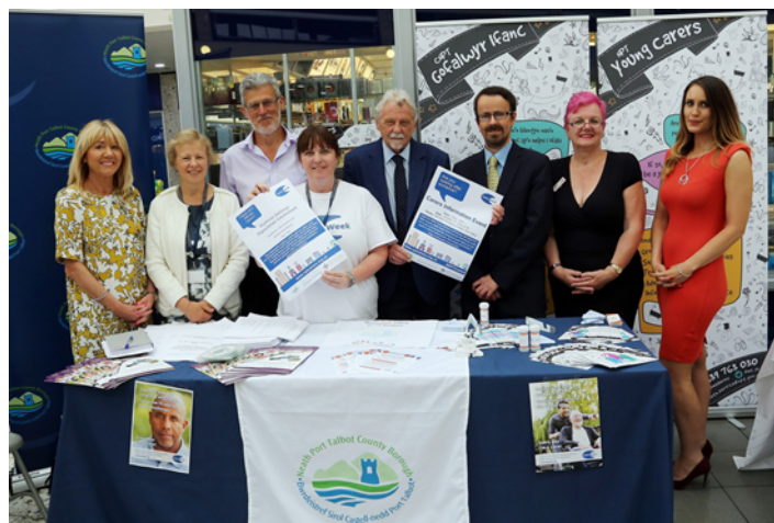
Neath Port Talbot Carers Service with representatives from Neath Port Talbot Local Authority, Abertawe Bro Morgannwg University Health Board and Western Bay Regional Partnership – Carers Week 2018

Swansea Carers Centre have used a portion of the Carers funding made available from Welsh Government to employ a Communication and Information Officer.