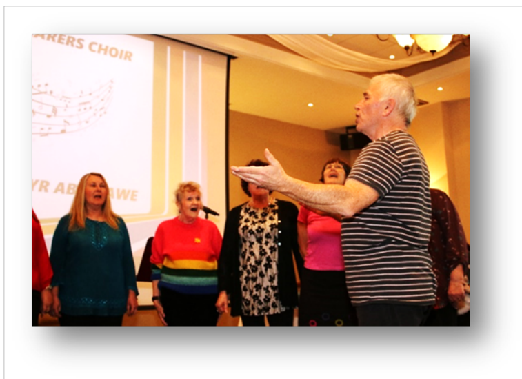
Swansea Carers Choir at the Celebrating Carers Event

Over 100 carers and professionals from across Western Bay came together at the Towers Hotel on the 4 th March. The focus of the day was celebration; to acknowledge and celebrate local Carers who make such a difference to the lives of the people they support, to celebrate new and innovating services which see health, local authorities and Carers Centres/ Service working together to support carers and to celebrate individuals who carers have nominated as having 'gone above and beyond'. The chair of Abertawe Bro Morgannwg University Health Board chaired the event.