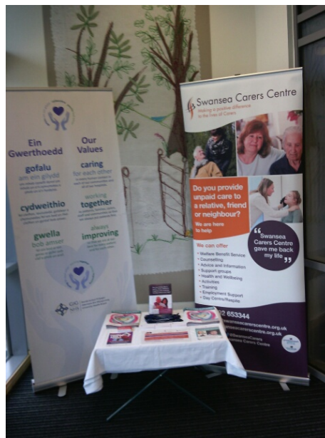
Information stands at Cefn Coed Hospital

The work at Bridgend and Neath Port Talbot Hospitals is funded from the Integrated Care Fund 2018-19. The work undertaken in Swansea Hospitals is funded from a range of sources including Welsh Government Carers Funding for 2018-19 and Integrated Care Fund 2018-19 for work with carers and families on paediatric wards.